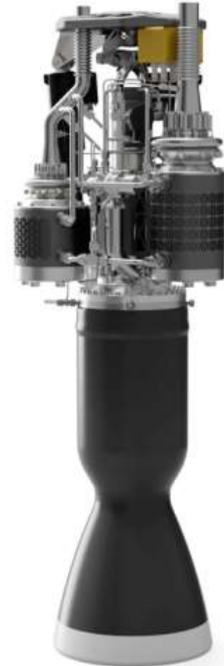
First Flight-Weight Engine Configuration