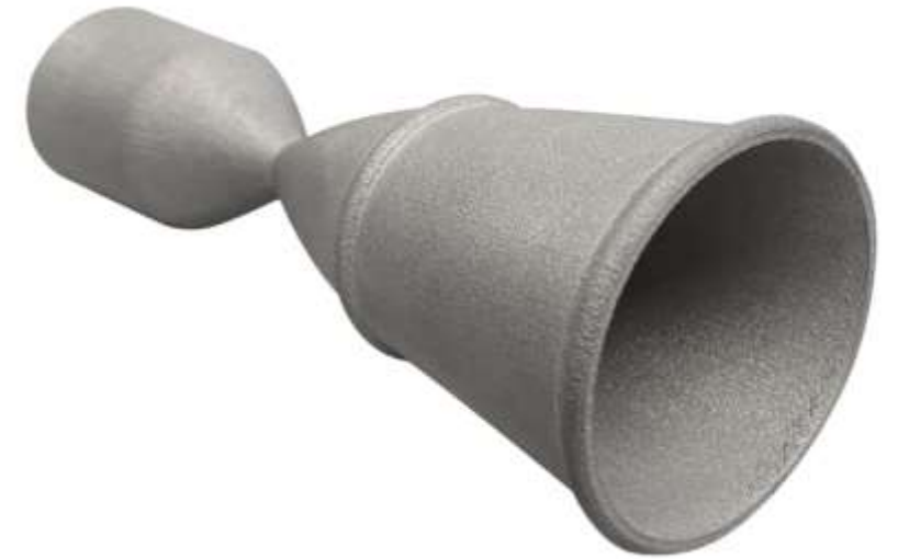
Trial Print of Thruster Chamber and Nozzle