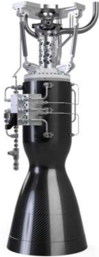
First Ground Test Engine