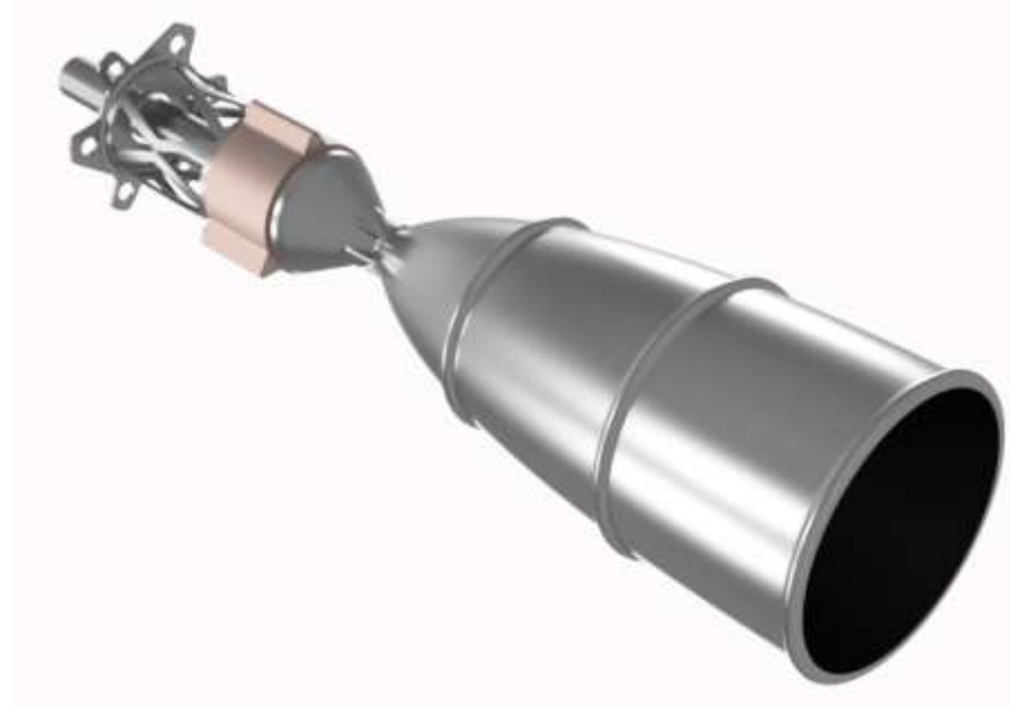
22 N In-Space Thruster