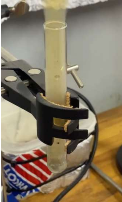
SHP163 Green Propellant Testing